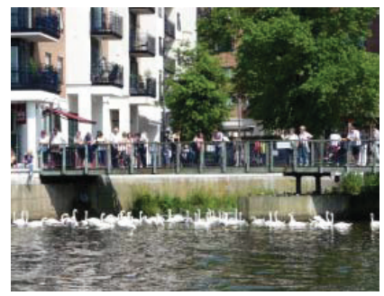
Feeding the swans

The reach is also impacted by the influence of the tide - high waters flowing over Teddington Weir when a spring tide coincides with a fluvial flood event. The tidal influence of this now extends as far upstream as Molesey Lock. During these events water levels can rise quickly to a height of up to 70cm above normal, covering riverside paths and open spaces; disturbing moored boats and depositing flotsam and jetsam.