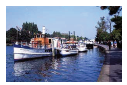
Turk's launches at the Queen's Promenade

4.04.8 2012 Update: Kingston's historic core between All Saints' Church and the Rose Theatre/Guildhall/Clattern Bridge complex has