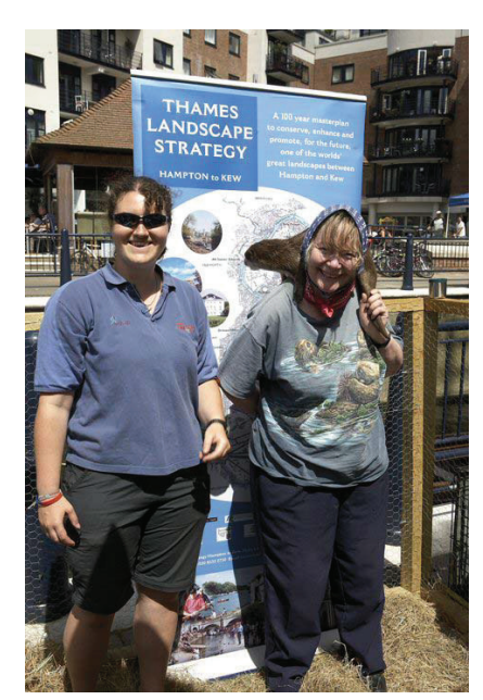
The Kingston River Festival