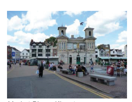
Market Place, Kingston

been improved with new furniture, lighting, water features and paving. Further enhancements to the Ancient Market Place are planned and a Heritage Lottery Bid for the All Saints religious precinct proposes the movement of the Coronation Stone back to its original position near to the church. A number of alleyways connect back to the bustling market centre of Kingston. Mostly the alleyways are dingy and forbidding – especially King's Passage but The Griffin shows how the connections can be made more welcoming, opening off the attractive Creek and Hogsmill River. Better design of these spaces to link the alleyways with Kingston's historic core would be helpful. In the long term, the construction of a principle route to link the town centre with the river could be possible as regeneration takes place. In the shorter term, improved signage, continuity of materials and innovative lighting could be used to encourage activity.